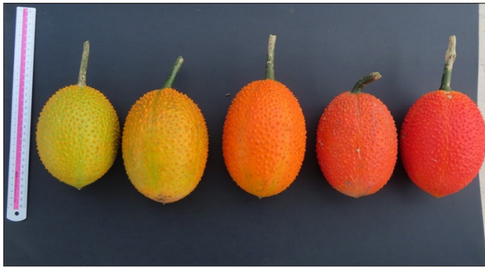
Figure 2. Gac fruits with different maturity index

The gac fruits, manually harvested at maturity index 4, had bright and vivid orange-red peel colors, with vibrant orange to reddish-orange skin, bright red or deep orange pulp, and a firm but slightly yielding texture. The fruits are harvested at maturity stage four because this stage represents the optimal point for several important physicochemical properties (Tran et al., 2016). At this stage, the gac fruit exhibits the highest levels of beneficial compounds, such as lycopene and beta-carotene, which are important for their antioxidant properties. The texture is also ideal for processing and consumption. Harvesting at this stage ensures the best nutritional content, flavor, and texture quality, making it suitable for fresh consumption and further processing. Additionally, data on the number of fruits per plant were recorded daily and summed up during the harvesting period.